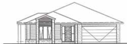
Front elevation showing proposed building materials.

Once approval has been given a building permit can be obtained and construction may begin.