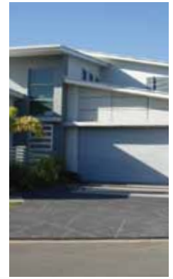
Acceptable materials for driveway construction.