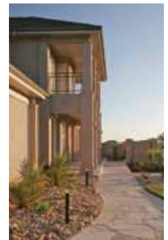
Suggested landscape designs include low maintenance, drought tolerant and native features.